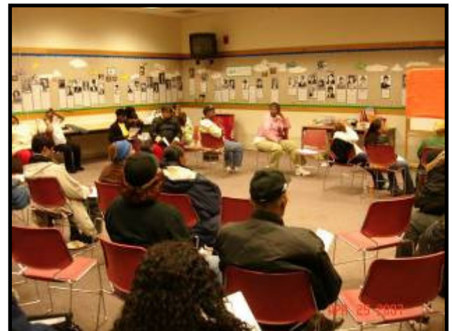
A Grove Parc Tenants Association Meeting